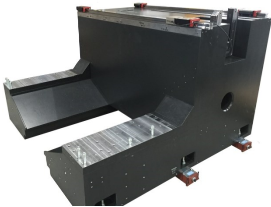
Machine element made by Kle-Rause, China